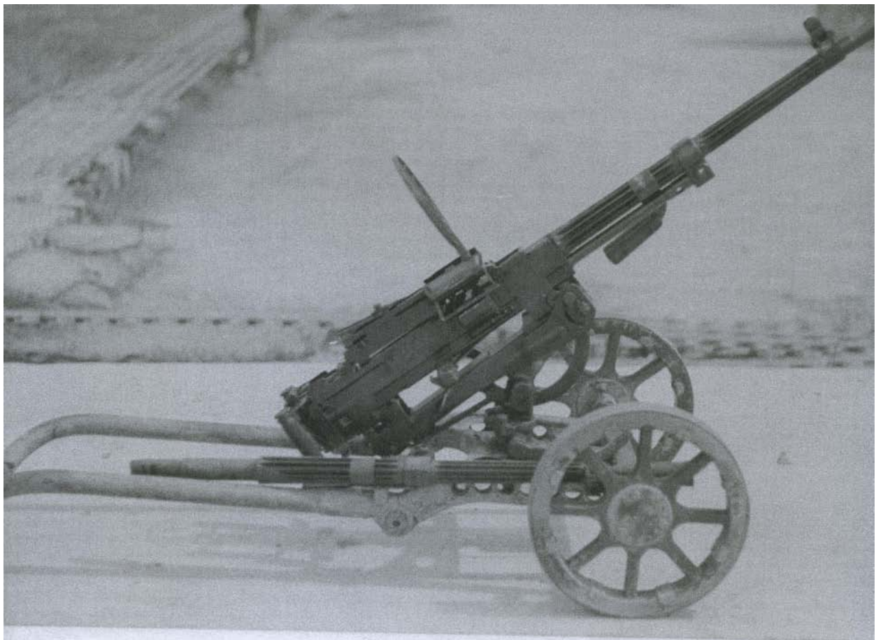
CAPTURED 12.7mm HEAVY MACHINE GUN